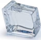
BM 805 AS on BIN 55