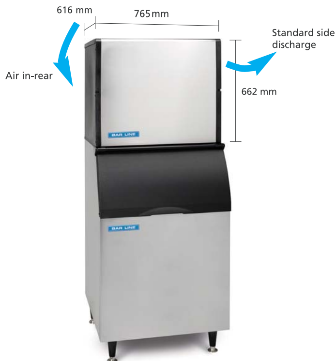
BM 805 AS on BIN 550