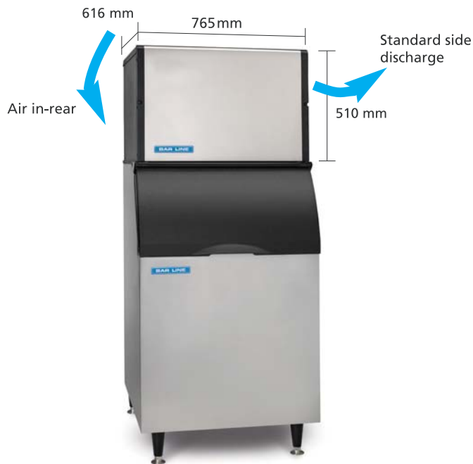
BM 605 AS on BIN 550