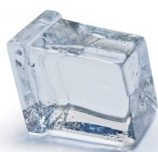
BM 405 AS on BIN 55