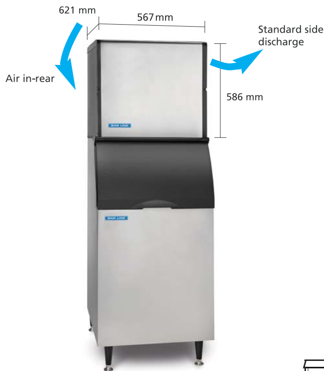
BM 325 AS on BIN 42