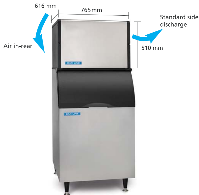
BM 305 AS on BIN 550