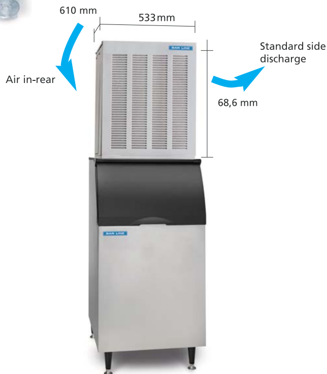
BG 655 AS on BIN 42