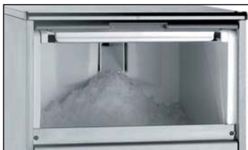
BF 80 AS/WS

All units have stainless steel finish. Refrigerant: R-134a