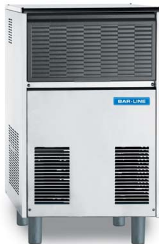
BF 80 AS/WS

Bar-Line Equipment range is the well-known EU-made line of ice machines used and appreciated by many for its reliability. Built in the Italian manufacturing plant of Frimont Spa, ISO 9001 Certified, these units are built with sturdy, corrosion resistant stainless steel, and feature European-made components to assure maximum ice-quality and machine longevity. Quality tested one-by-one, the Bar-Line self-contained units feature a well balanced ratio between production and storage capacity, alongside with reduced outer dimensions that allow for built-in installations. Contemporary, elegant design unites excellent operational features with the reliability obtained through years of successful experience in ice making technology.